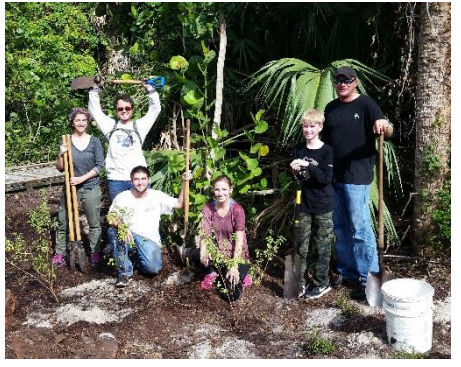
Finished butterfly garden in Area 1