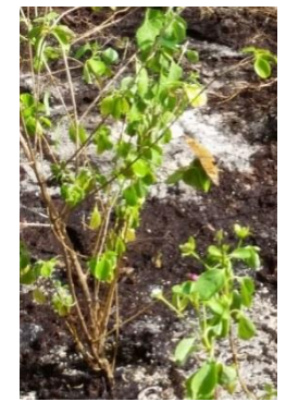
Common Buckeye butterfly on White Lantana

Many months ago, volunteers and staff removed dead Sea Grape trees from a section in Area 1. This left a large open space and many of us wondering what we should do with it. Soon the idea of the butterfly garden blossomed! Several volunteers spent many hours in the sun and heat removing the remaining dirt, roots, sticks, and weeds from the designated area. On September 26, a butterfly garden was born! Six volunteers spent the morning planting 50 native butterfly attracting plants; plants include Scorpion Tail, White Lantana, Horsemint (a.k.a Spotted Beebalm), Tropical Sage (red), and Blue Curls.