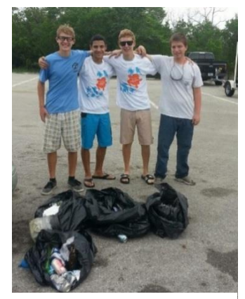
Volunteers at Coastal Clean-up